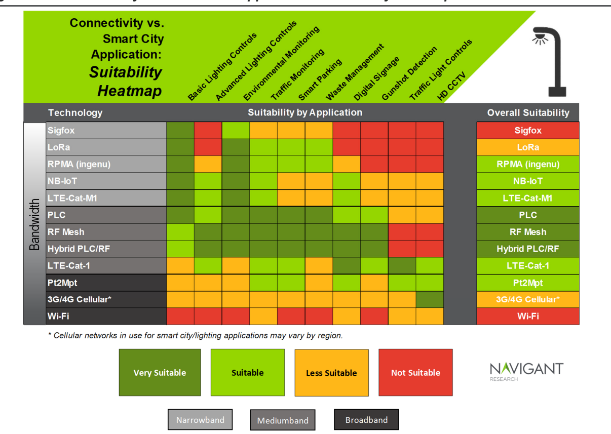
Figure 3.1 Smart City Platforms and Applications: Suitability Heatmap

In order to map diverse application requirements and networks capabilities, Navigant Research analyzed the core requirements for ten smart city applications (shown in Table 3.1) and compared them with the networking technology characteristics shown in Table 3.2. A scoring system was devised based on how well each networking solution meets the requirements of each application in order to generate a heatmap of the most attractive networking solutions for each application and overall. The heatmap provides a visual representation of the strengths and weaknesses of the networking solutions reviewed.